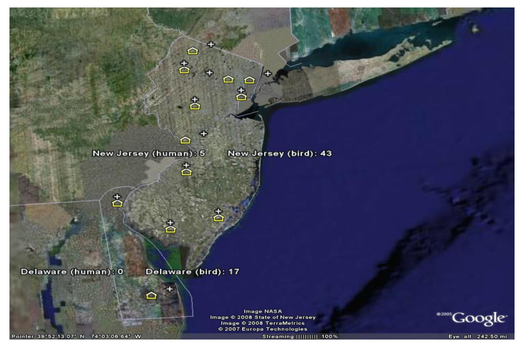
Figure 2: WNV and temperature data for Delaware and New Jersey in 2006.

The application was developed in one and a half months. In addition to application development, this time included research to find available Web 2.0 resources as well as project design. The KML maps are displayed in Google Earth for 2006 and 2007 (figures 2 and 3); they show the total number of human and bird cases and a label for each weather station. Next to each weather station is a '+' or '-', indicating whether the degree-day was above or below the assigned threshold. For 2006 and 2007, both states have every weather station above the threshold (all have a '+'), which suggests that the weather in each state supports viral transmission. However, in New Jersey, the number of human cases decreases from 2006 to 2007 while the number of bird cases remains relatively the same. In Delaware, the number of bird cases decreases slightly.